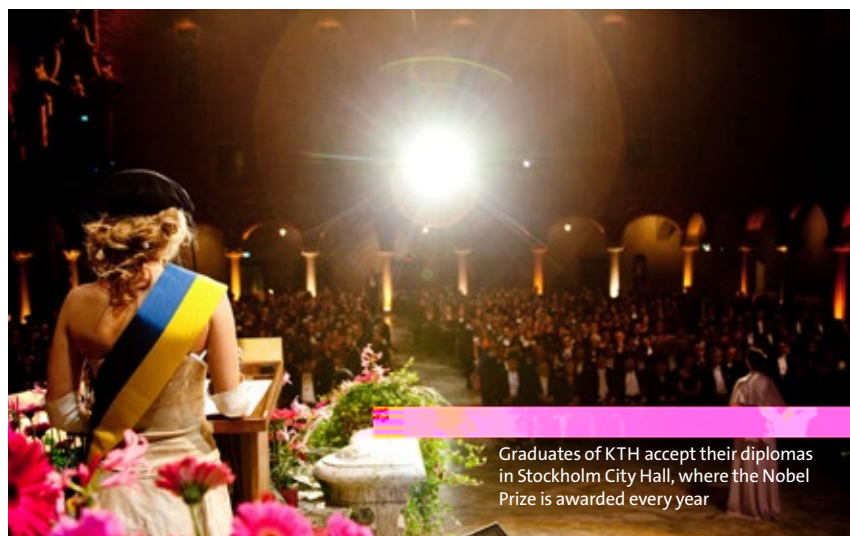
Graduates of KTH accept their diplomas in Stockholm City Hall, where the Nobel Prize is awarded every year