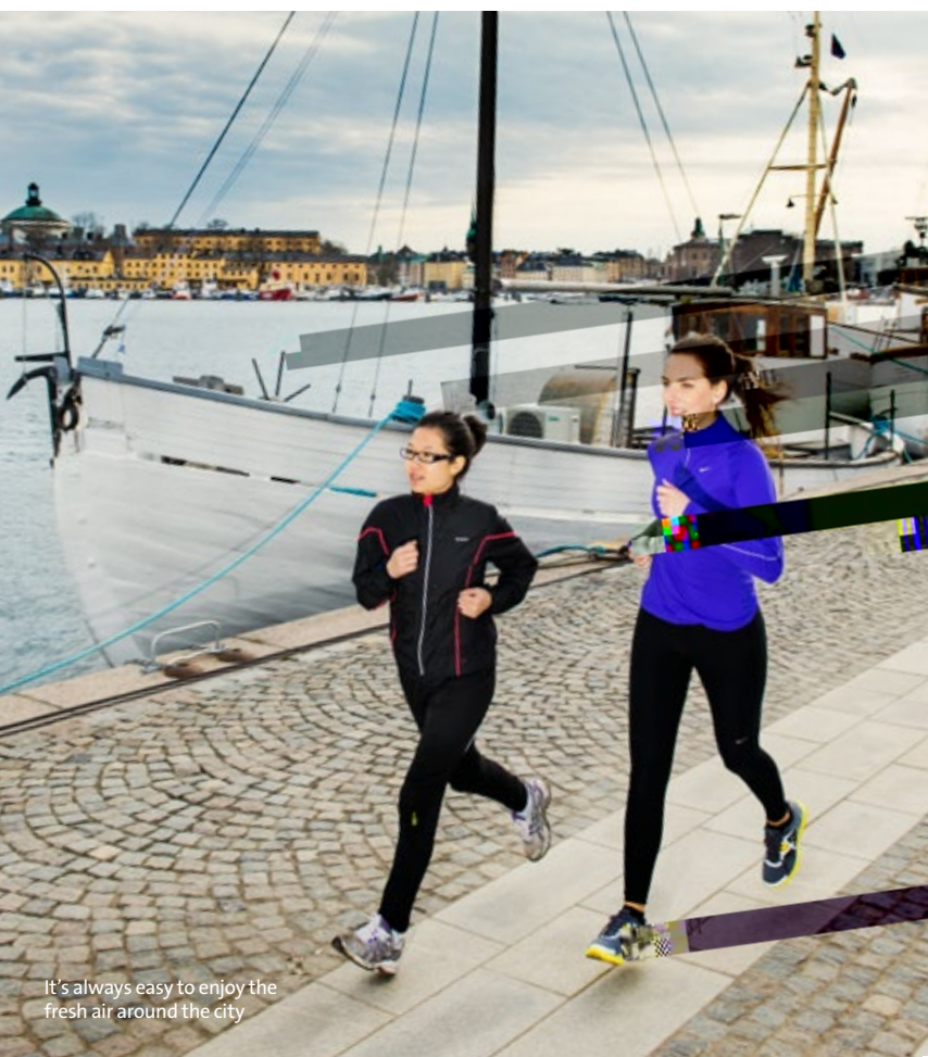
It's always easy to enjoy the fresh air around the city