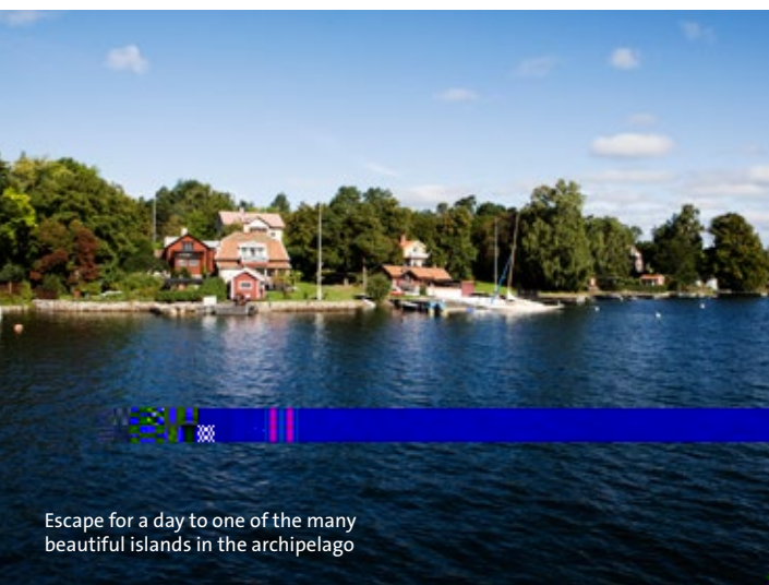
Escape for a day to one of the many beautiful islands in the archipelago