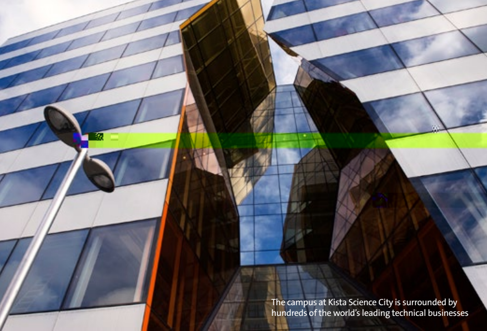
The campus at Kista Science City is surrounded by hundreds of the world's leading technical businesses